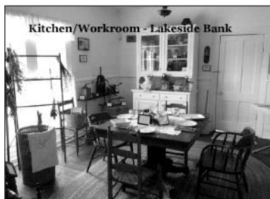
Kitchen/Workroom, Lakeside Bank